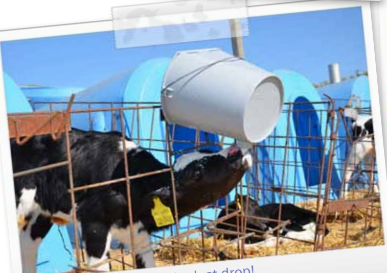
To the last drop! A Holstein Friesian calf at EkoNivaAgro