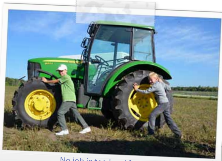
No job is too hard for us! John Deere fans at the Field Day in Tula oblast

EkoNiva-News continues to publish the best snapshots under the FOCUS ON US! project. We urge participation on everyone who believes that interesting moments showing country life and people working the land are worth preserving for posterity.