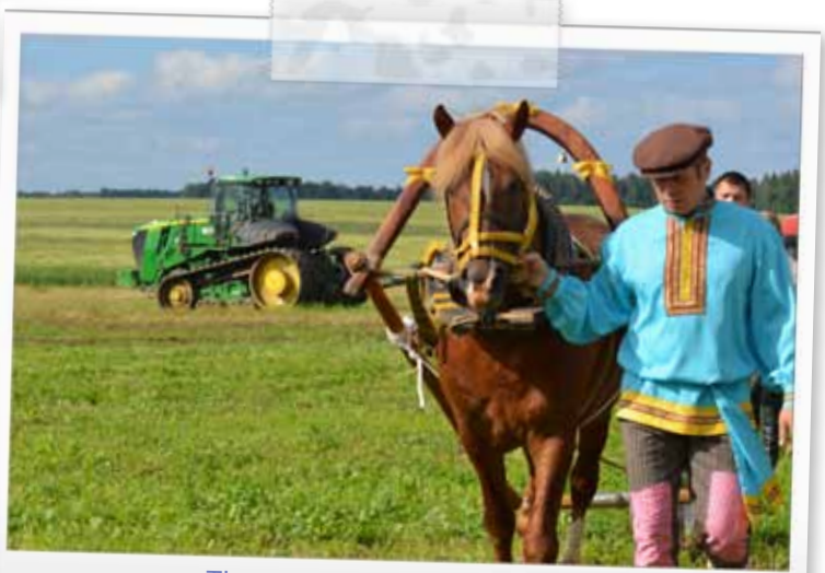
The past meets the present at Field Days in the Kama region (Perm Krai)

Please, send you photos marked FOCUS ON US! to: