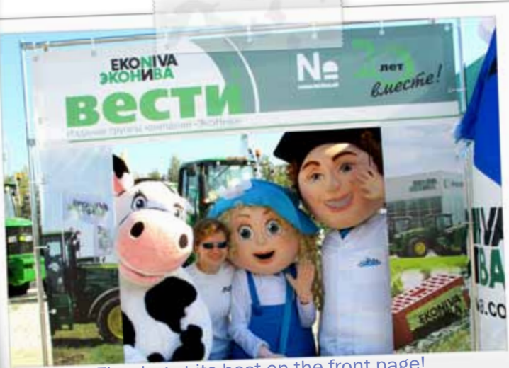
Figuring at its best on the front page! Heroes of the Academy of Dairy Science greet guests at the opening of the Ryazan servicing centre

EkoNiva-News continues to publish the best snapshots under the FOCUS ON US! project. We urge participation on everyone who believes that interesting moments showing country life and people working the land are worth preserving for posterity.